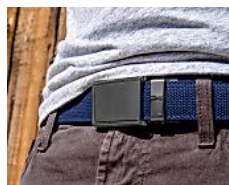
You'll Never Go Back to a "Normal" Belt After You