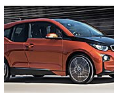
Mileage Maxers Rejoice! 30 Cars With 40+ MPG