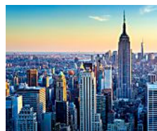
This Startup Wants To Turn Your $5K Into $2.5