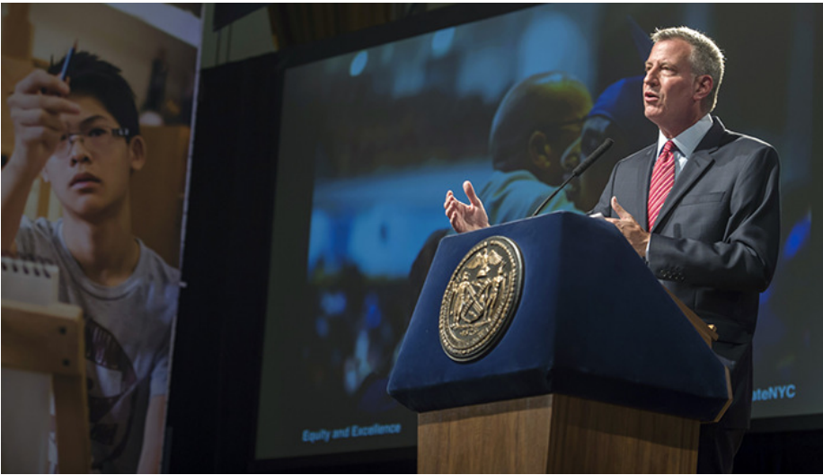
Mayor Bill de Blasio.

By ELIZA SHAPIRO 3:28 p.m. | Nov. 6, 2015 1