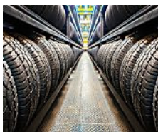
New York Drivers Are Stunned By This New Rule